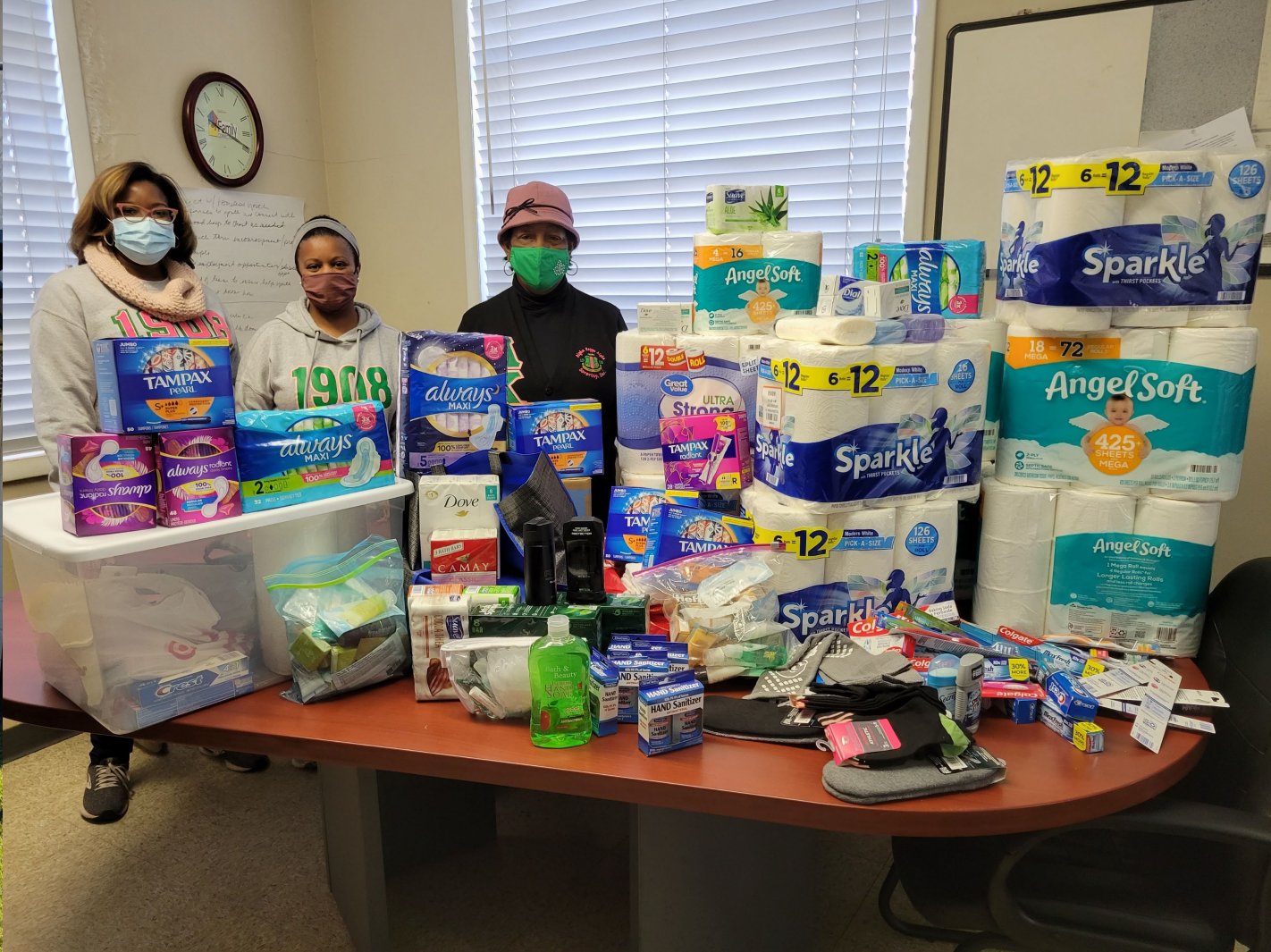
Items collected and donated to a shelter for homeless teens